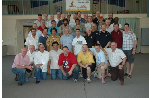
Townsville 2008 menALIVE participants